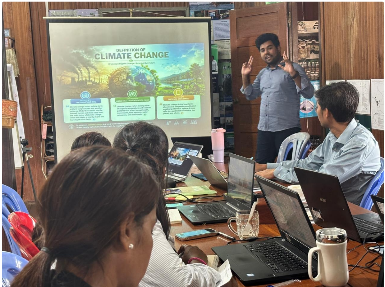
A SEEP exchange participant leads a session on the definition and drivers of climate change.

The session was facilitated by SEEP Exchange Participants with support from Norec .